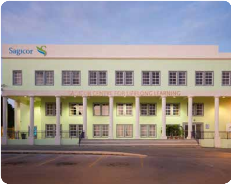
Sagikor Centre for Lifelong Learning (MAIN CAMPUS Map Ref 27)