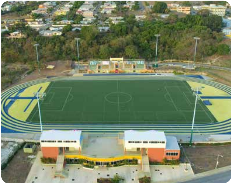
Usain Bolt Sports Complex (Map PARADISE PARK Ref 46)

Please refer to the Campus Map on page 152 for site locations.