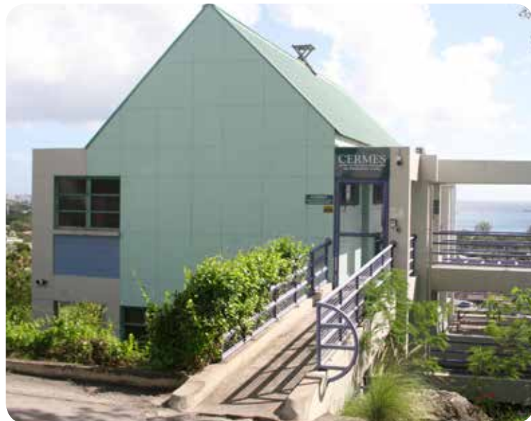
CERMES (Map MAIN CAMPUS Ref 12)

Please refer to the Campus Map on page 152 for site locations.