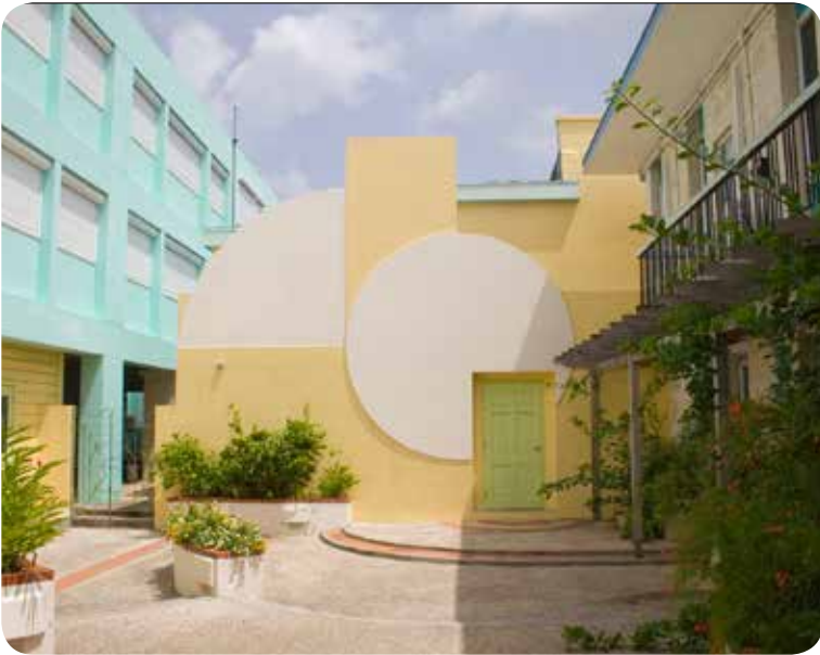
Faculty of Humanities and Education (Map MAIN CAMPUS Ref 20)

Please refer to the Campus Map on page 152 for site locations.