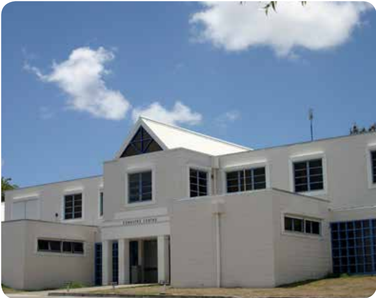
Campus IT Services (Map MAIN CAMPUS Ref 23)

Please refer to the Campus Map on page 152 for site locations.