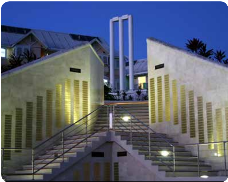
Walk of Fame (Map MAIN CAMPUS Ref 31)

Please refer to the Campus Map on page 152 for site locations.