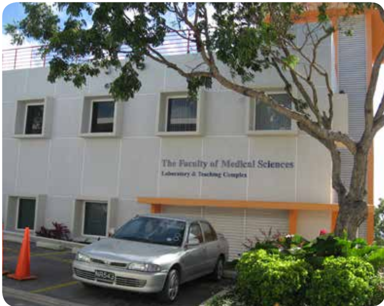
Medical Sciences - Laboratory and Teaching Complex (Map MAIN CAMPUS Ref 11)

Please refer to the Campus Map on page 152 for site locations.