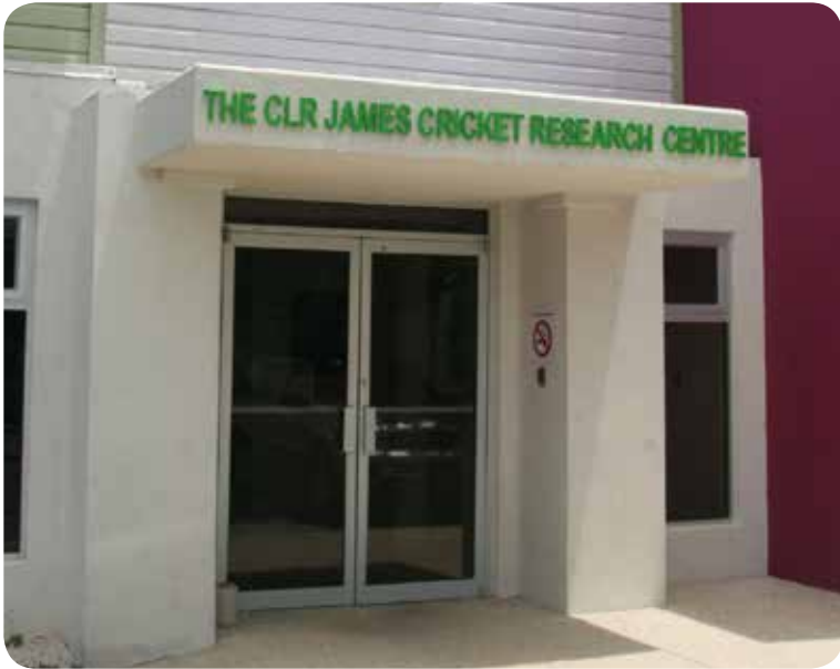
CLR James Centre for Cricket Research (Map MAIN CAMPUS Ref 2a)

Please refer to the Campus Map on page 152 for site locations.