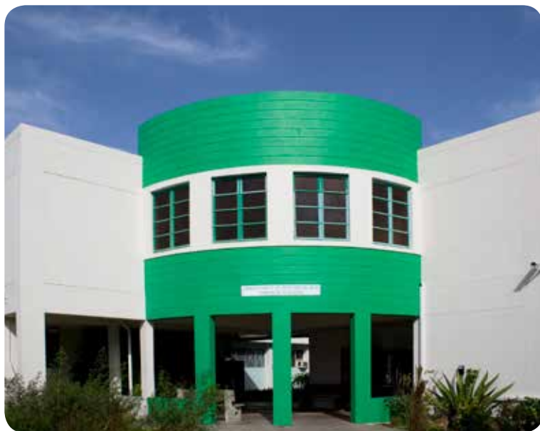
Dept. of Biological and Chemical Sciences (Map MAIN CAMPUS Ref 18)