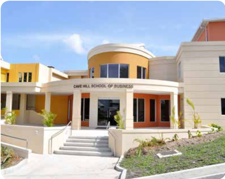
Sagor Cave Hill School of Business (Map CARICOM PARK Ref 36)

Please refer to the Campus Map on page 152 for site locations.