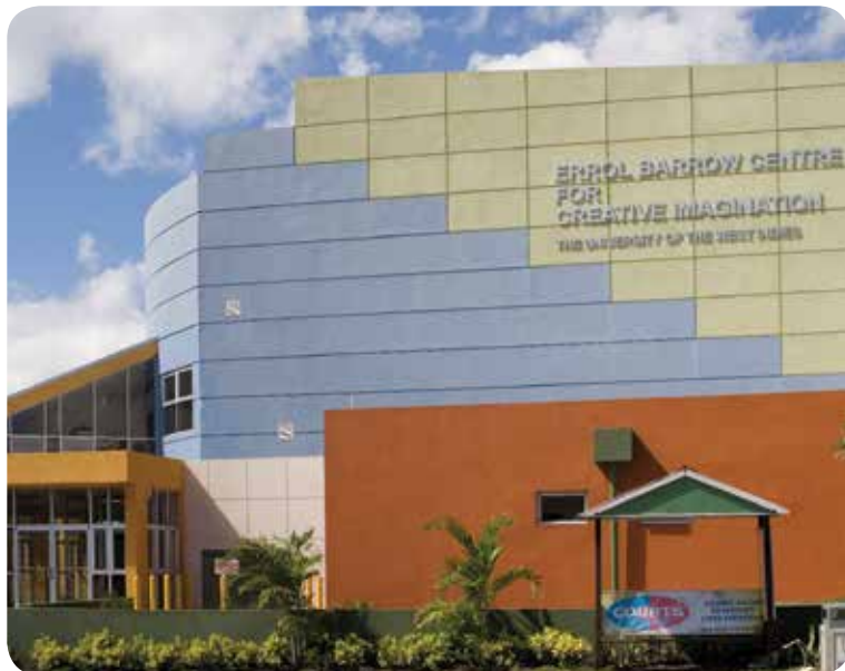
The Errol Barrow Centre for Creative Imagination (Map MAIN CAMPUS Ref 39)

Please refer to the Campus Map on page 152 for site locations.