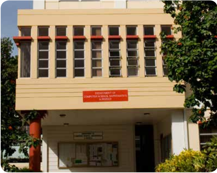
Dept. of Computer Science, Mathematics & Physics (Map MAIN CAMPUS Ref 17)