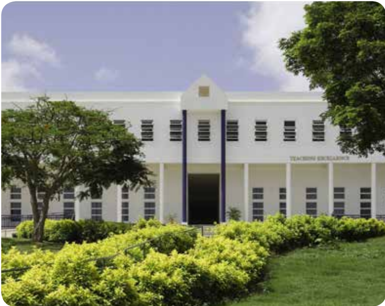
CLICO Centre for Teaching Excellence (Map MAIN CAMPUS Ref 27a)

Please refer to the Campus Map on page 152 for site locations.