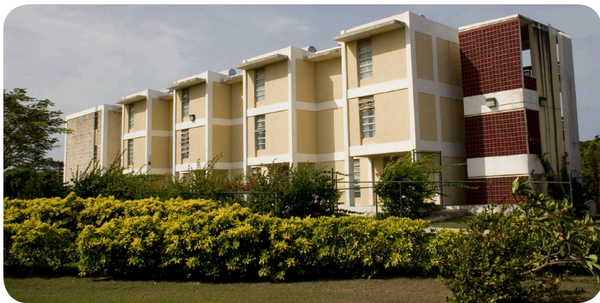
Sherlock Hall MAIN CAMPUS

At Sherlock Hall the communal facilities include a students' lounge/ TV room, a study room, laundry unit and 2 small seminar rooms. The latter are mainly used for student development and counseling sessions organized and facilitated by the Office of Student Services & Development.