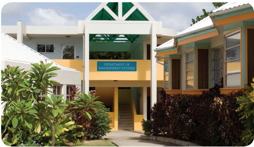
Dept. of Management Studies