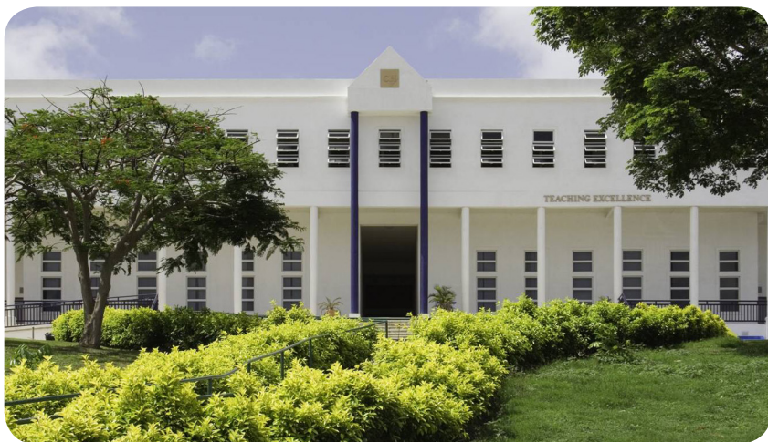
CLICO Centre for Teaching Excellence