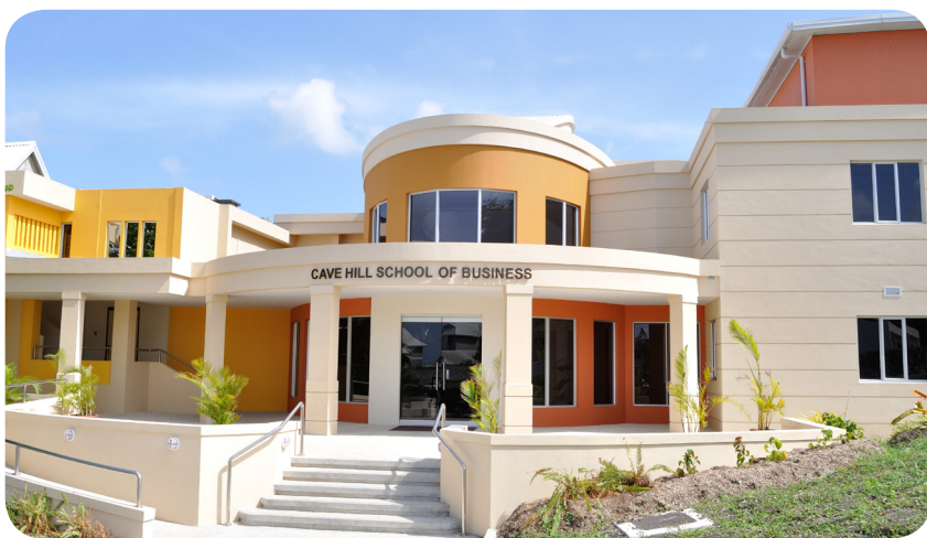
Sagikor Cave Hill School of Business