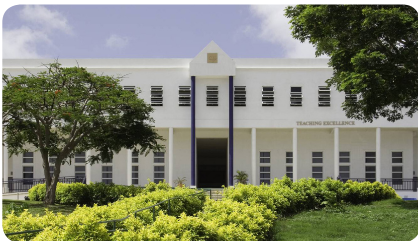
CLICO Centre for Teaching Excellence