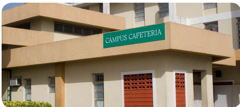
Campus Cafeteria MAIN CAMPUS

The Campus Mart, a convenience store located in the basement of the CLICO Building, sells a variety of food items in addition to other goods.