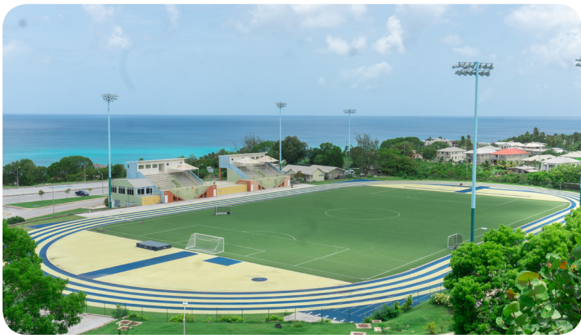
Usain Bolt Sports Complex