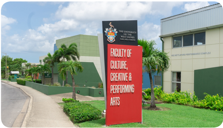
Faculty Of Culture, Creative and Performing Arts