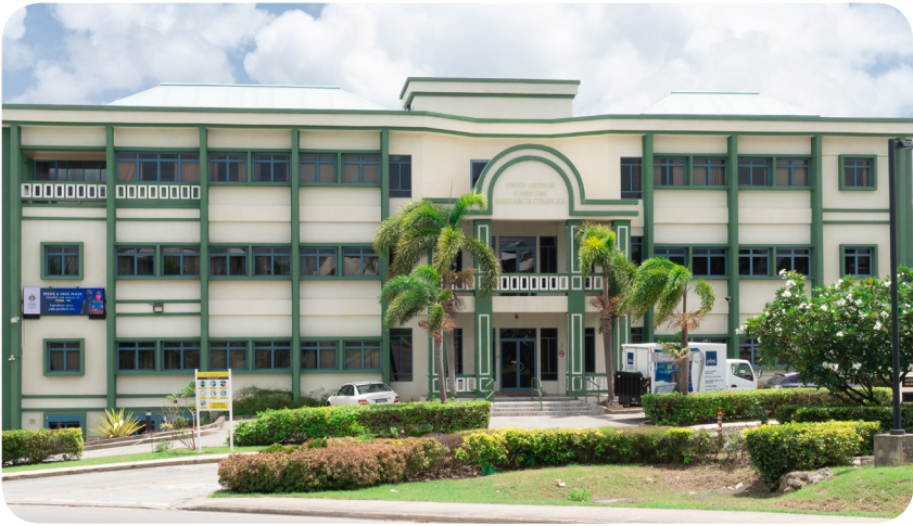
Owen Arthur CARICOM Research Complex CARICOM PARK