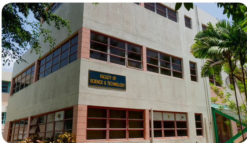
Faculty of Science & Technology