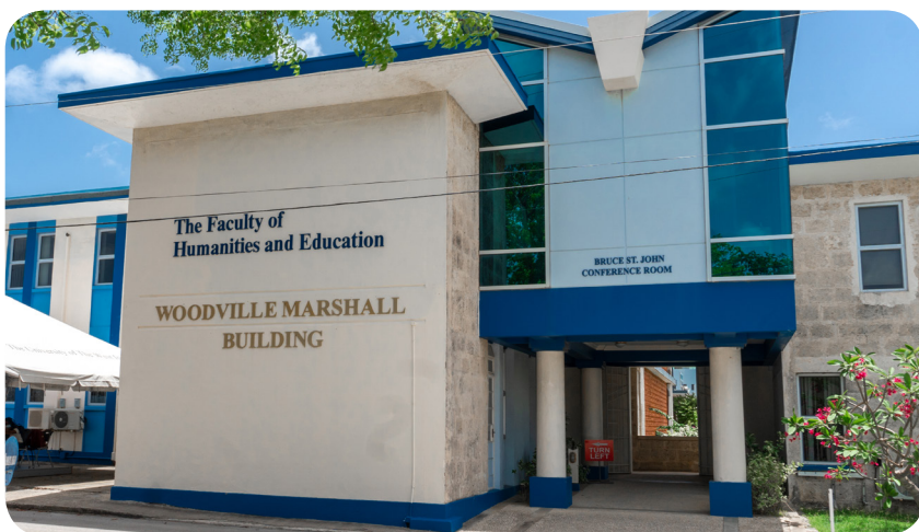
"Woodville Marshall Building" Faculty of Humanities and Education