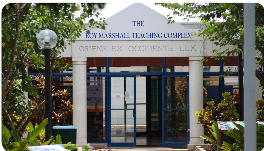
Roy Marshall Teaching Complex