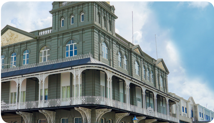
The UWI in the City