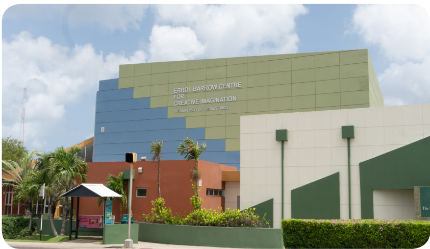
The Errol Barrow Centre for Creative Imagination