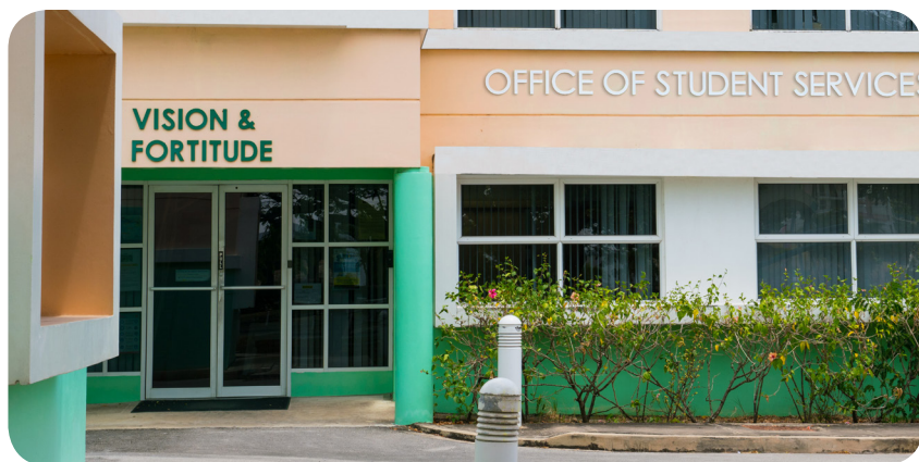
Office of Student Services & Development / SEED MAIN CAMPUS

Additionally, the OSSD coordinates a number of leadership training workshops for student leaders and provides support to the Guild of Students, Student Associations, Clubs and Societies. Other skills-based activities are facilitated through the Co-curricular credit programme, Mentorship, Internship, and Students Helping Students programmes. The OSSD also coordinates services and accommodations for students with disabilities. Through its services and programmes, the OSSD continues to create ways to help students become well-rounded individuals prepared for professional and leadership roles in the world of work and active citizenship.