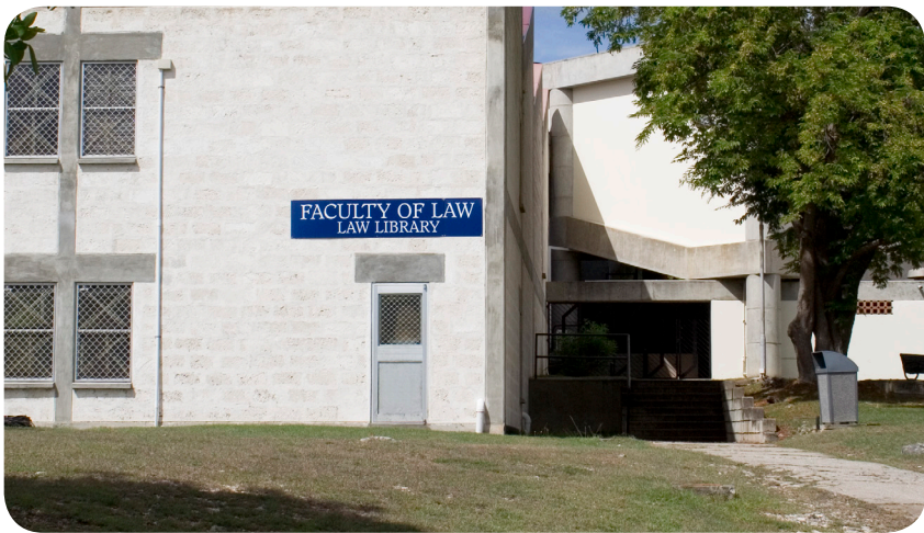
Faculty of Law