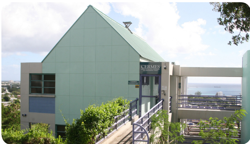
Centre for Resource Management and Environmental Studies (CERMES)