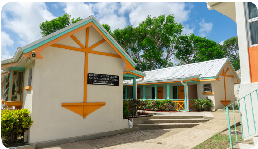
Institute of Gender and Development Studies: Nita Barrow Unit