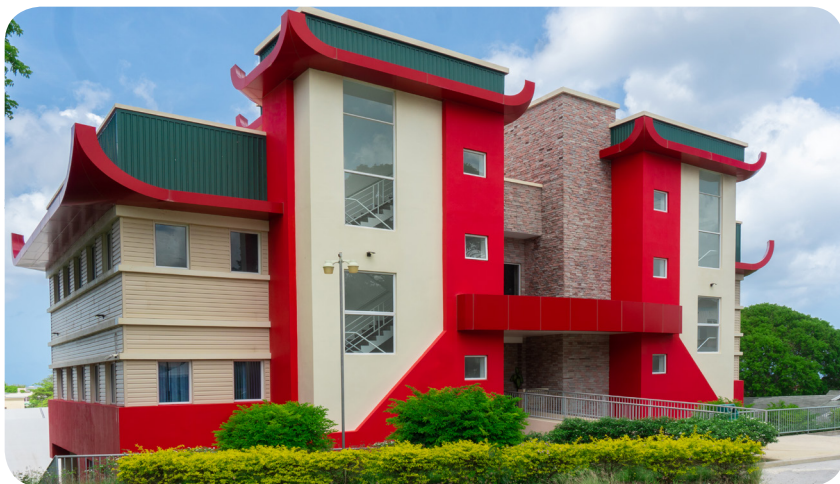
The Confucius Institute MAIN CAMPUS