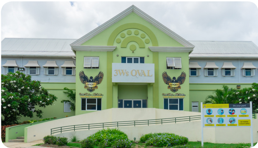
The Pavilion, 3Ws Oval