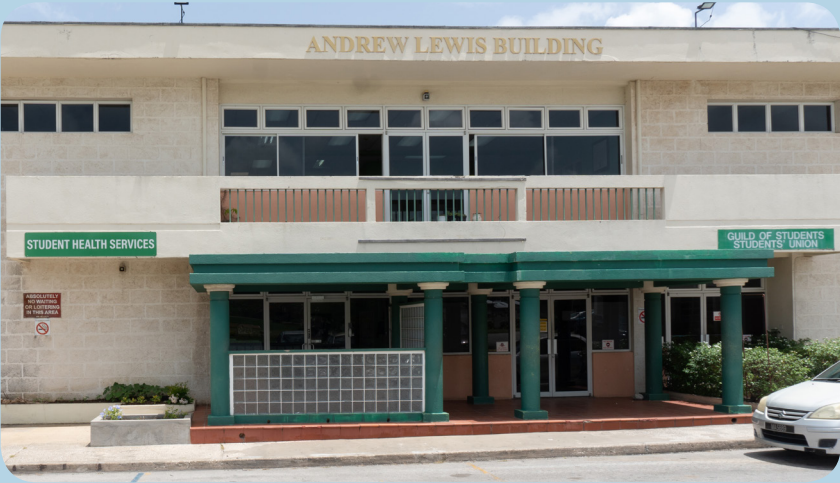
Andrew Lewis Building MAIN CAMPUS