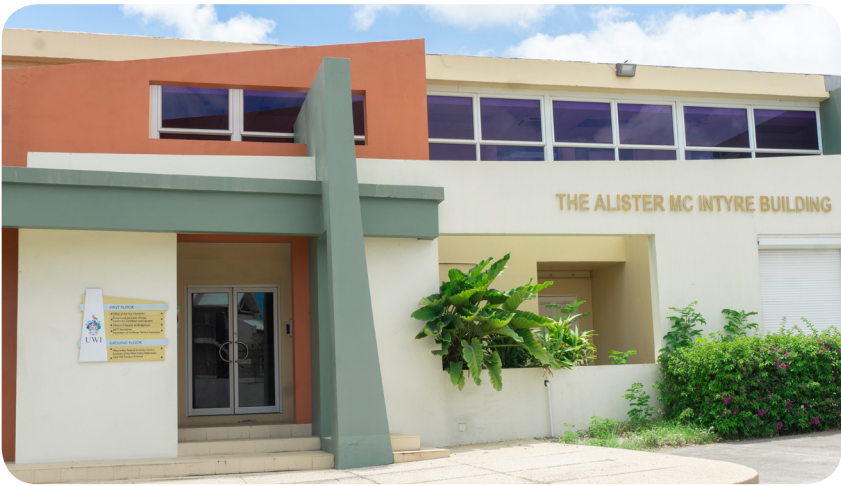
The Alister McIntyre Building