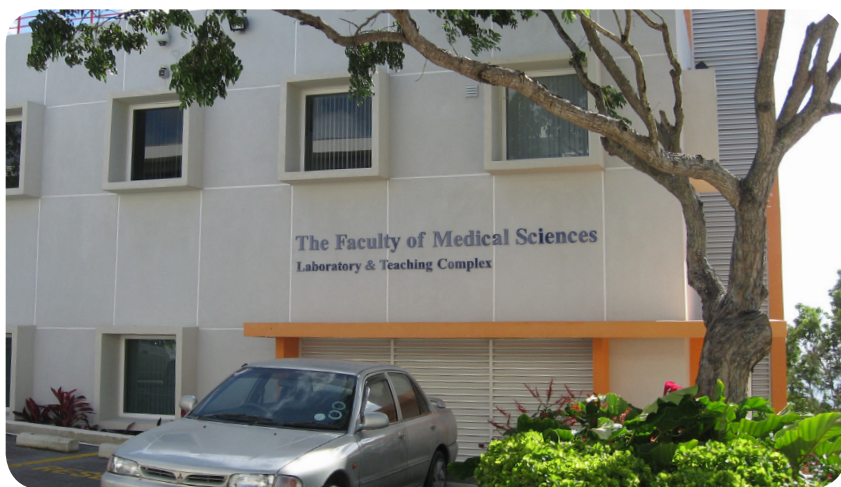
Faculty of Medical Sciences - Laboratory and Teaching Complex