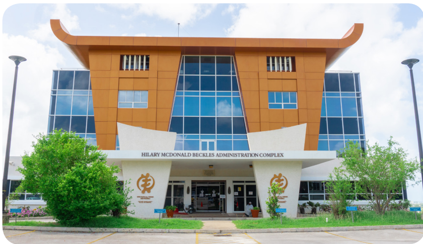
Hilary McDonald Beckles Administration Complex MAIN CAMPUS