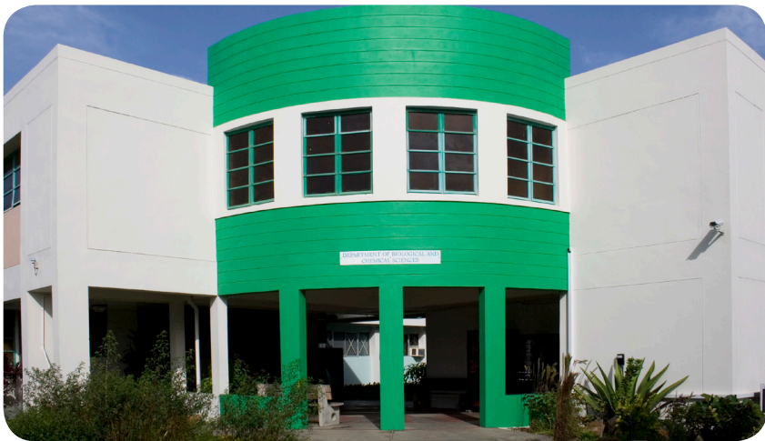
Dept. of Biological and Chemical Sciences