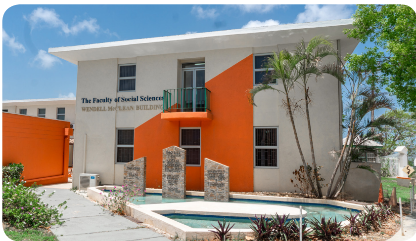
Faculty of Social Sciences "Wendell McClean Building"