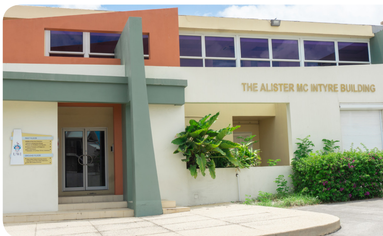
The Alister McIntyre Building