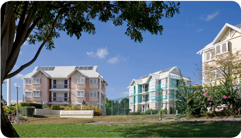
Frank Worrell Hall