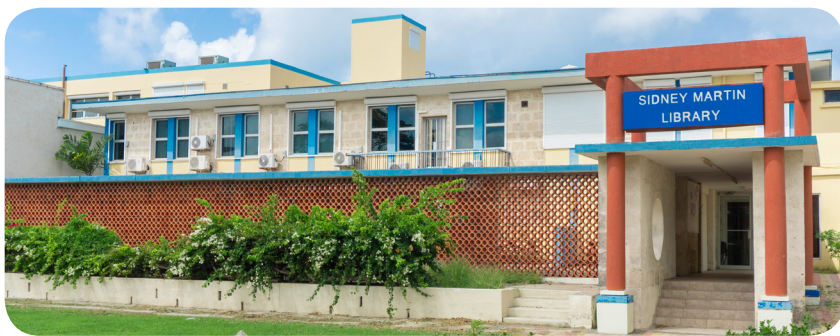
Sidney Martin Library (Main Library) MAIN CAMPUS