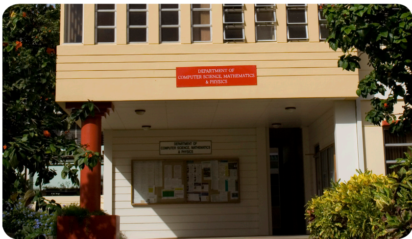
Dept. of Computer Science, Mathematics & Physics