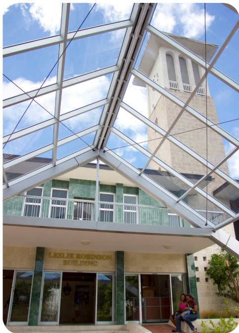
Leslie Robinson Building MAIN CAMPUS