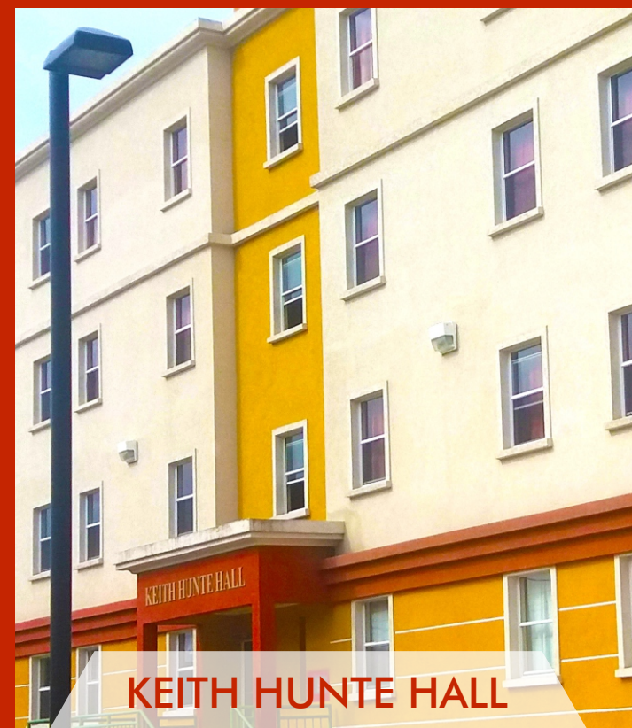
KEITH HUNTE HALL