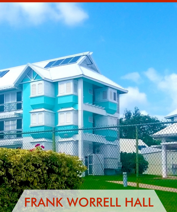
FRANK WORRELL HALL

Police 211 Fire Service 311 Ambulance 511 Police Hotline 429-8787