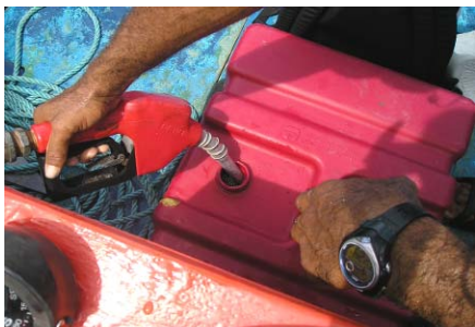
Figure 6. Refueling portable gas tank at pump station on the jetty, Petite Martinique, Grenada

Use premium two-cycle engine oil (TC-W3 or TC 4). Premium oils improve engine performance and reduce pollution because they burn cleaner, contain more detergents and prevent formation of carbon deposits.