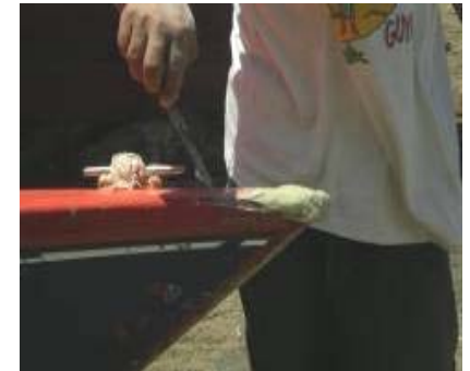
Figure 3. Boat refurbishing, Carriacou, Grenada