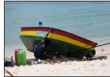
Figure 4. Boat cleaning on the beach – Not good!!