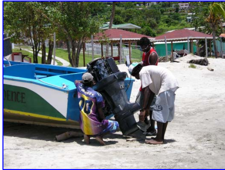
Figure 1. Engine maintenance on the beach

Vessels require a great deal of attention. The engines in particular must always be well maintained – and engine maintenance was the “Number One” priority identified by water taxi operators in the Grenadines. Good engine maintenance maximizes capacity and minimizes fuel consumption thereby increasing reliability at sea and reducing the chances of polluting the environment.