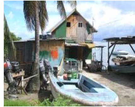
Figure 2. Boat yard, Ashton Village, Union Island.