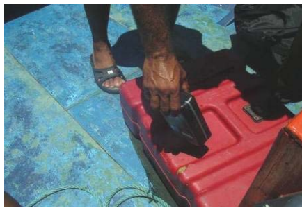
Figure 7. Adding oil to the gas (premix), Petite Martinique, Grenada