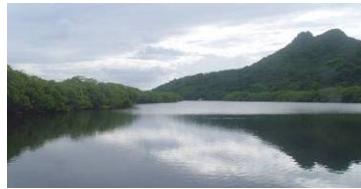
Cont'd p. 2

SusGren has played an active and important role in developing the contracts, liaising with local groups, evaluating proposals and coordinating meetings.