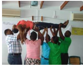
Teams in Action—Building trust

Role plays were also used to further strengthen the points brought across on teams in action, building trust, conflict resolution and leadership .