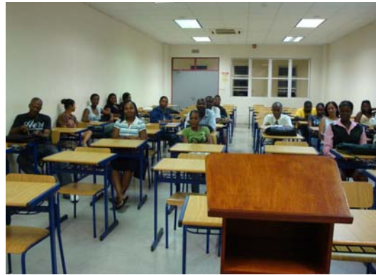
CARIBBEAN INSTITUTE, 2009 PARTICIPANTS