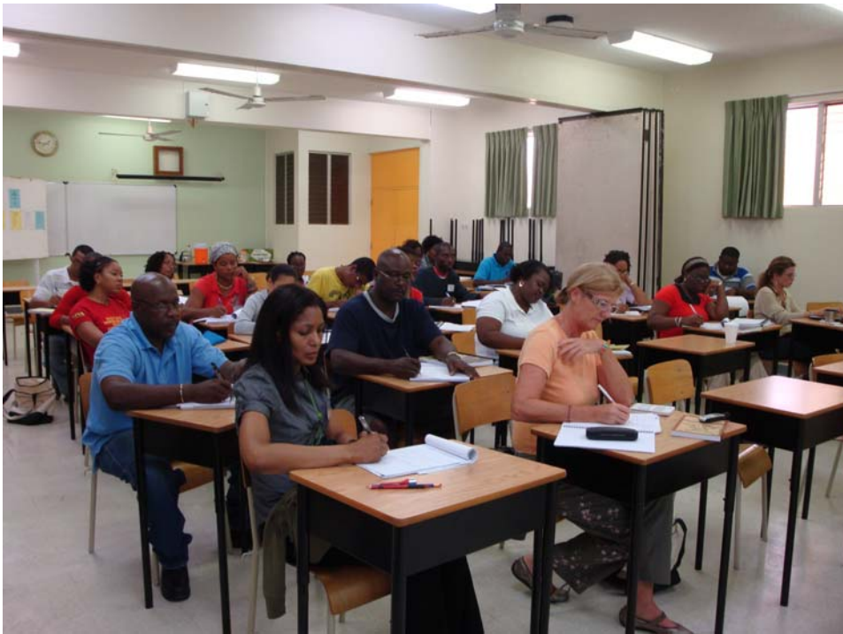
Honouring Barbadian Women in Communities International Women's Day, 2009